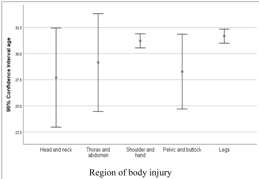
Figure 3: The average age of the victims based on the location of injury from the organs of the injured patients referring to rabies units in the Najaf Abad, Isfahan (2012–2017).