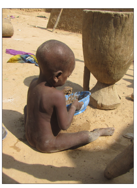
Figure 4 A boy plays with soil on the floor of his home.

Lead is a potent neurotoxin that is especially harmful to the developing brains of young children. In Zamfara in 2009–10, lead-rich ore dust covered the soil floors of homes ( Figures 4 and 5 ), became incorporated into foods prepared and served on the ground, and rapidly left many children