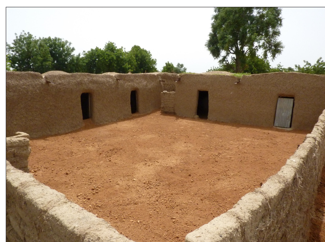
Figure 5 A recently remediated home in Zamfara State. Contaminated surface soils have been excavated and replaced with soils certified to be <20 mg/kg Pb.

The deteriorating security has complex roots in long-standing ethnic tensions, inadequate governance, and extreme poverty, similar to the situation in 2009 when Boko Haram's terrorism of Borno began [10, 35, 39]. Just as each of these factors alone cannot explain the acute crisis