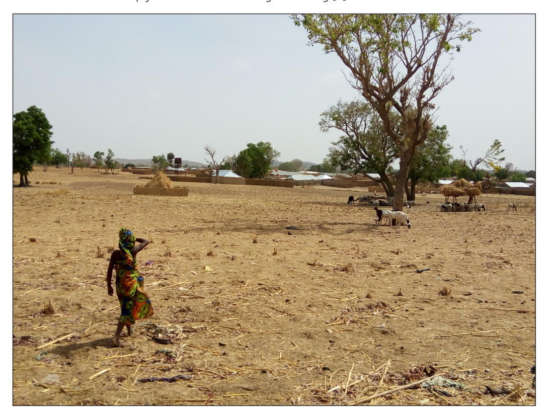
Figure 2 A child walks home on the outskirts of Abare Village, Zamfara State in 2011.

Rates of preventable diseases soared, and polio made a resurgence [16, 18]. Aid organizations such as Médecins Sans Frontières (MSF, Doctors Without Borders) began regularly surveilling for outbreaks of cholera, malaria, measles, and meningitis. MSF was on such a surveillance mission in 2010 when health workers in remote areas of Zamfara reported high mortality rates in children in Anka and Bukkuyum Local Government Areas [1]. Acute lead poisoning was eventually identified as the cause, and a multidisciplinary response team investigated and found the affected communities were deeply involved in artisanal gold mining [2].