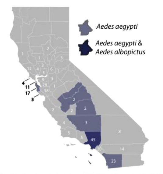
*Data from: United States Geological Survey/CDC, California Department of Public Health

Figure 3. The distribution, burden, and risk of dengue in California, 2010-2014. Light-shaded counties are those where an Aedes aegypti infestation has been reported; dark-shaded counties have reported both A. aegypti and A. albopictus infestations; only Los Angeles County, as of early 2015, reported a continued A. albopictus presence. Values represent the number of imported dengue cases to that county over the 4-year period. All cases must be laboratory confirmed before incorporation into the USGS/CDC-ArboNET database.