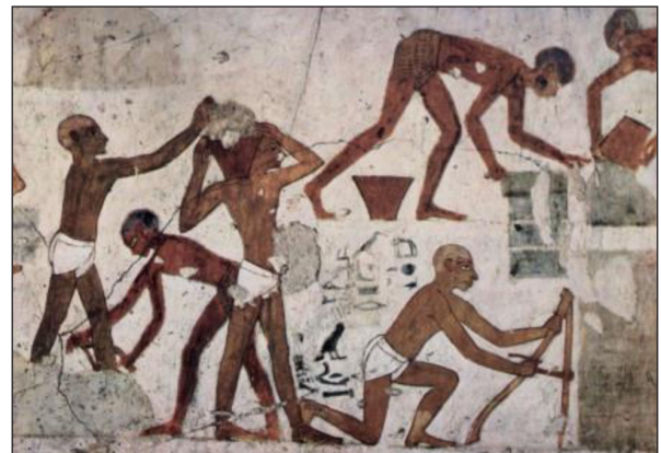
Figure 1a: Detail of Figure 1.

Kiln-dried bricks were superior in quality to sun-dried bricks. The latter tended to disintegrate when subjected to floods and shrivel under the intense heat of the summer sun.