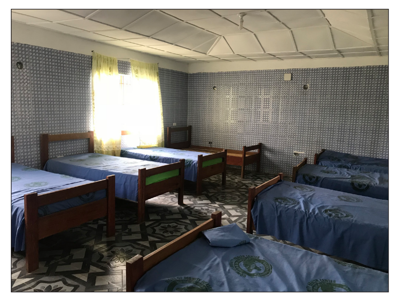
Figure 3: Patient care room.