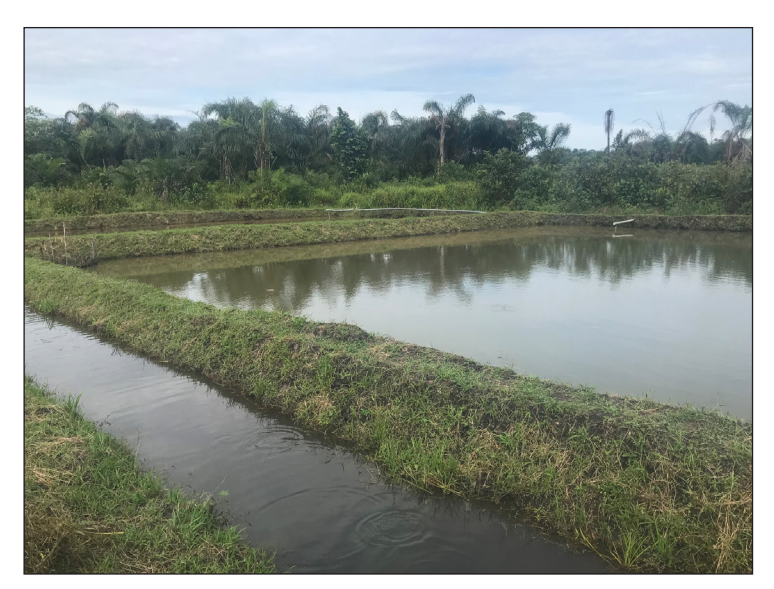
Figure 4: The on-site aquaculture farm was developed to provide a source of nutrition and revenue to support the Center's operations.