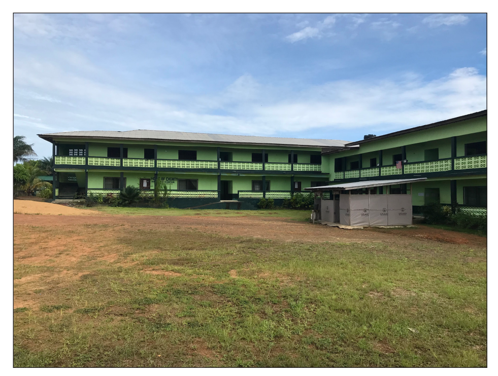
Figure 1: Patient ward at Home of Dignity Health Center.

We analyzed patient characteristics (age, gender, mobility status, and CD4 count on arrival) and outcomes (survival rate and community reintegration) for patients with HIV seeking care at the Center from December 1, 2013 through December 31, 2017. Information had been collected as part of routine patient record keeping; these were reviewed on-site under supervision of the clinical care team, with all patient identifiers removed. Data was analyzed in Excel. Information reported on HIV prevalence was previously supplied by the Center's clinical team. We also reviewed overall patient numbers to assess overall demand, including patients presenting during the Ebola epidemic.